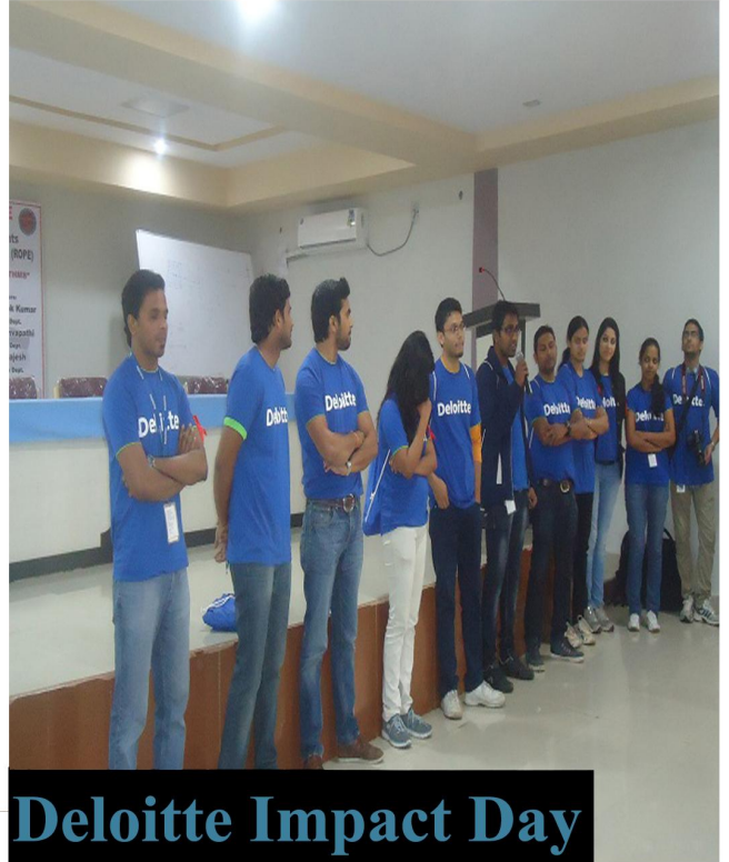
Deloitte Impact Day