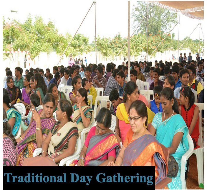
Traditional Day Gathering