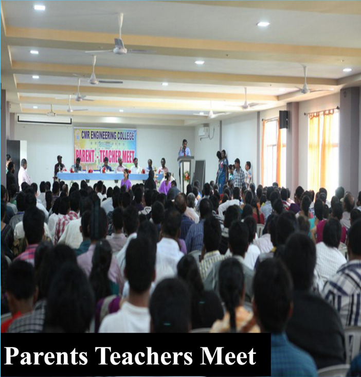
Parents Teachers Meet