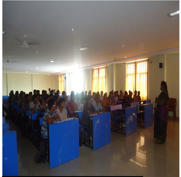
Expert Lecture On JAVA