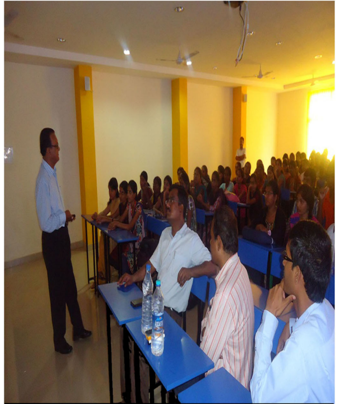
Lecture on Personality Development