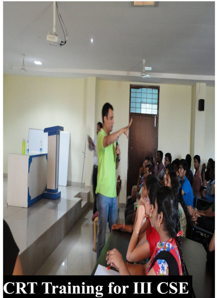
CRT Training for III CSE