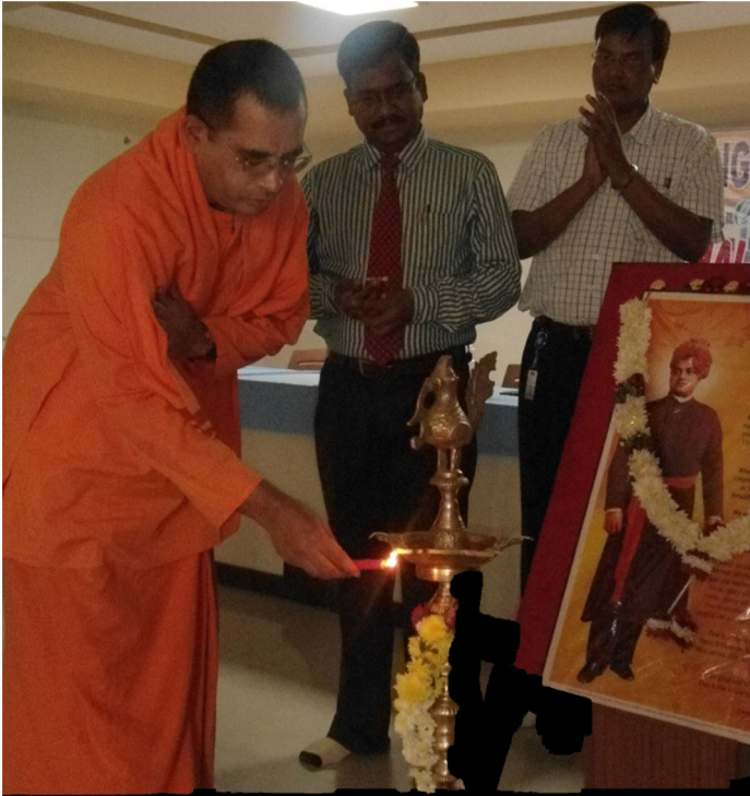
Center for Human Excellence