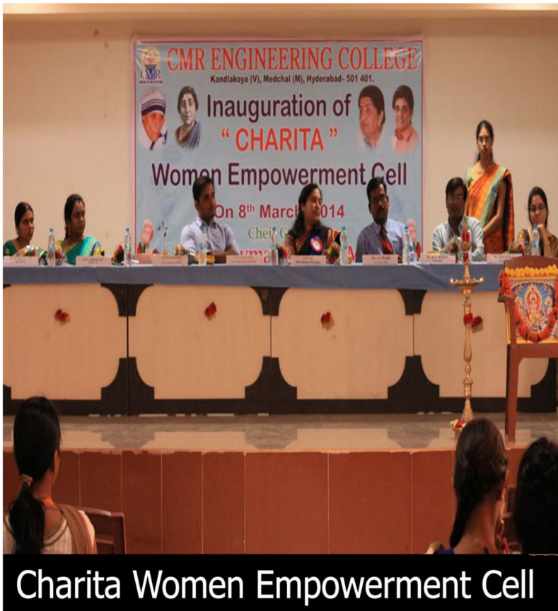
Charita Women Empowerment Cell