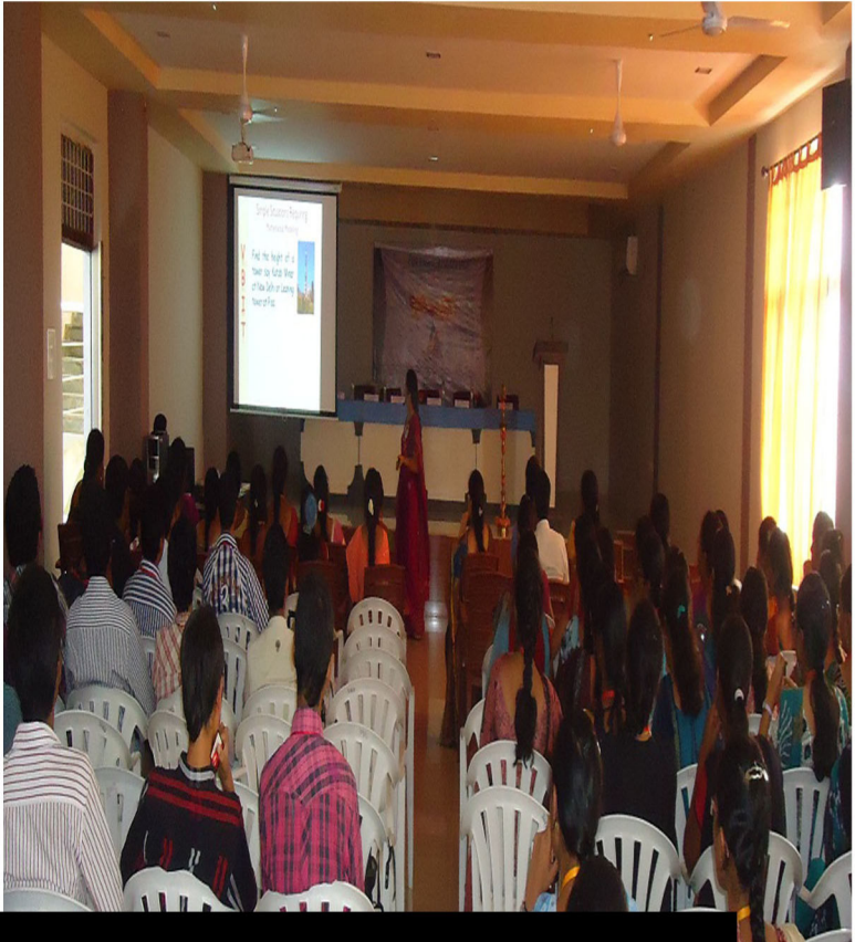
Workshop on App Development